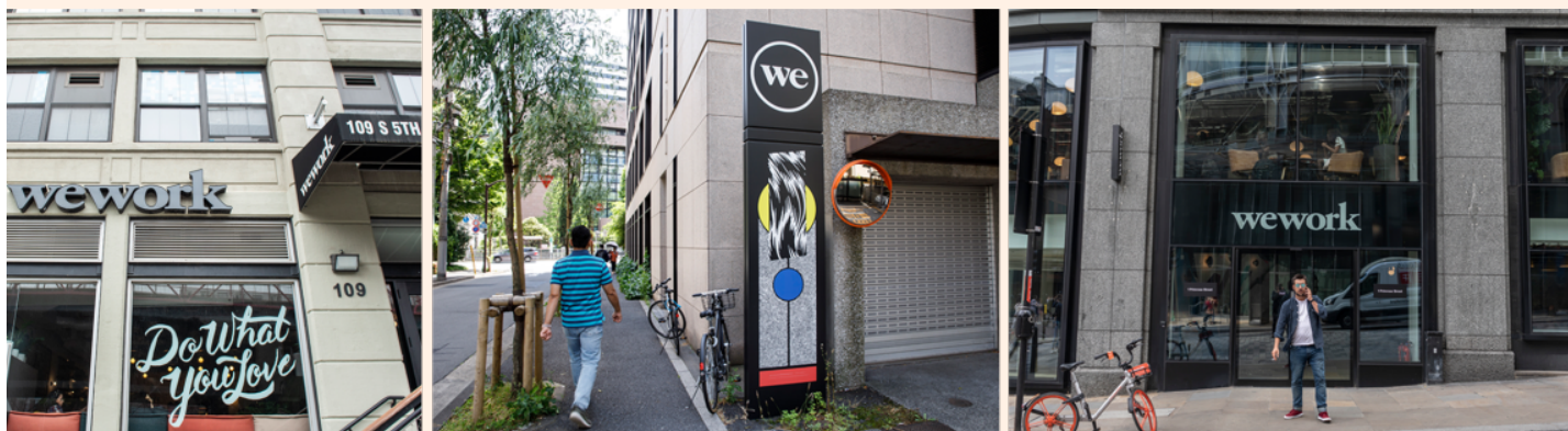
oklyn, New York, Minato-ku, Tokyo and Spitalfields, London

"What he brought to the table was a bigger thinker, which we thought was hard to find because we thought we were quite big thinkers," Mr Neumann told the FT in an interview in May. "He came in and said, 'Woah, woah, woah, wait. Why [target] only a million members when you can have 5m?'"