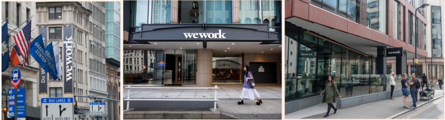
growing: last year the company generated $19bn

While his earlier ventures failed, including a company that sold women's shoes with collapsible heels and another that made baby clothes with knee pads, WeWork has turned the kibbutz-raised Israeli into a paper billionaire. He is, however, known to be unpredictable, bending the company to his own interests as when he banned employees from expensing meals containing meat or bought a manufacturer of wave-making machines. It is a trait that has raised tensions for some investors who hope to soon sell their holdings.